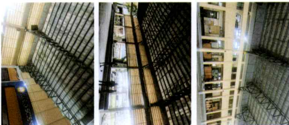
ACTUAL PHOTO OF AREAS TO BE REPAINTED